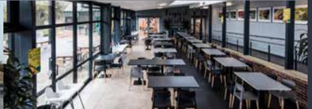
Retail & Leisure