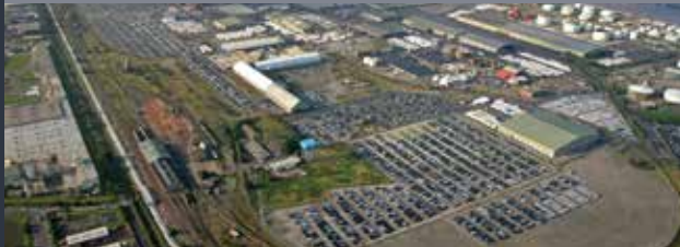
Ports (Air & Sea)